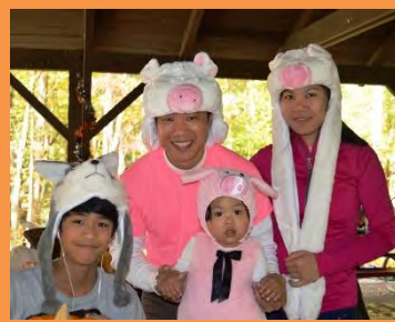
Halloween Winners!!! From different Categories...